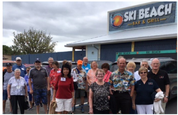
1 st Group of hungry club members