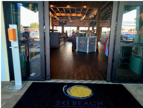
The welcoming committee